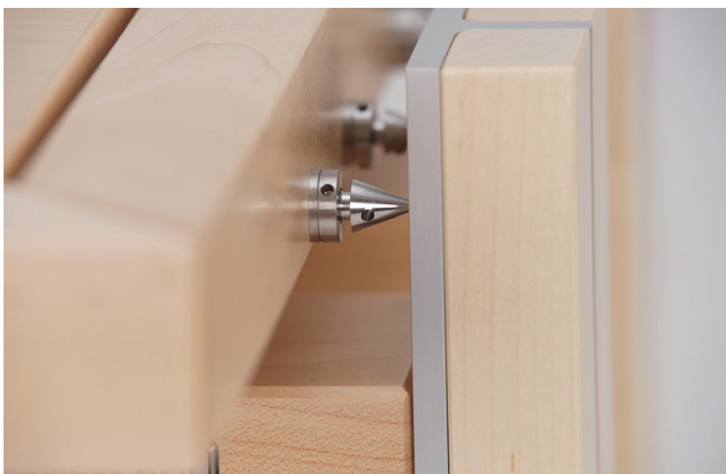
As with the original Pagode, the levels of the MK II are tensioned in between the T-shaped pillars with four stainless steel spikes on each side

The Pagode to be reviewed is an 85 centimeter high 600 Edition MKII with four levels. The Canadian maple is stained in walnut colour finished with clear matte varnish. The aluminum pillars, which are clad with the same type of wood for reasons of resonance damping, are high-gloss polished. It comes with solid stainless steel cones as feet, which in the MKII version feature an integrated floor protection plate. This prevents the cone from sinking into the carpet and causing the rack system to lose its horizontal levelling or getting unstable. With the old Pagode the plate had to be placed separately under the more simple looking spikes, and could also lose contact when being moved. If you were unlucky, the spike then most likely scratched the sensitive floor. This risk is now virtually eliminated with the integrated plate.