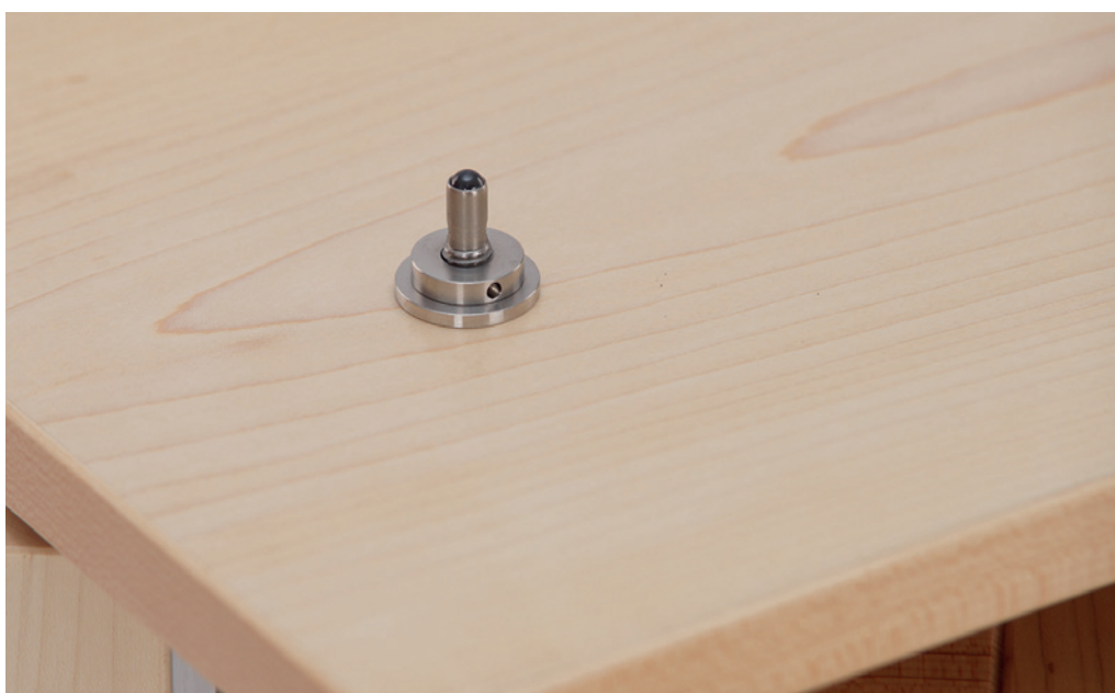
This is what the new ceramic ball bolts that couple the shelves of the MK II to the frames look like