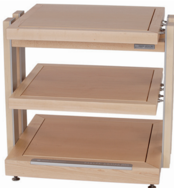
Its unique concept, great craftsmanship and outstanding sound characteristics honour the Pagode MK II

The differences between the two Pagode stands were of similar nature when it came to Luigi Boccherini's "Sonata for Violoncello in G major", played by Bruno Cocset and Les Basses Réunies, although this piece of music appeared to be much calmer and more solemn than the jazz piece. With the new Pagode, the finely detailed lower registered string instruments not only became more dynamic, slender and orderly, but also depicted a pleasantly coherent atmospheric picture throughout the fundamental range, much more adequate to the instrumentation in play. No doubt, this was musically convincing, and above all it was more exciting to listen and immerse oneself in the music. When we transferred the Soul music server together with the Soul E power